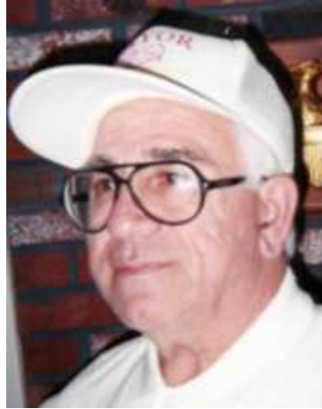
Mayor Alfred Andreola

Milford, Mass 01757 ♦ www.prospectheightsmayors.com